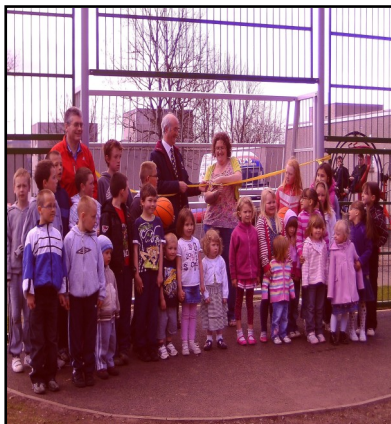
Opening of Ball Wall by WTO April 2010

With the help of the committee and hard work from our treasurer / secretary the WTO secured the land and sufficient funding from Scottish Borders Council to built a ball wall and are planning to install further play parks when funding becomes available..