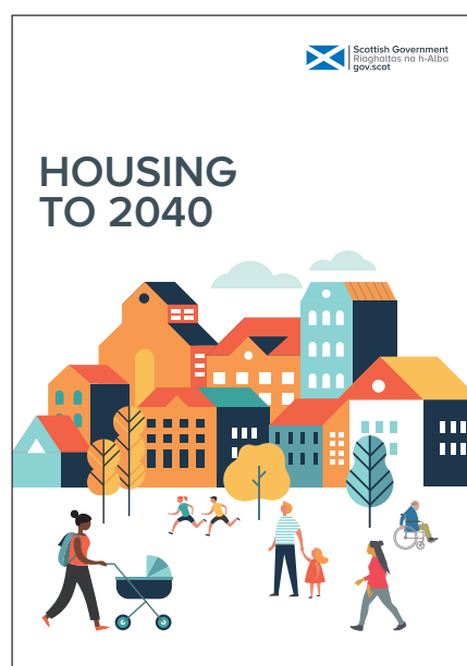
Housing to 2040

Regional Network representatives recently met the Cabinet Secretary for Social Justice, Housing and Local Government, Shona Robison MSP, and Minister for Zero Carbon Buildings, Active Travel and Tenants' Rights, Patrick Harvie MSP, to discuss issues such as COVID recovery support for tenants, Housing to 2040: www.gov.scot/publications/housing-2040-2/ and the review of the Scottish Social Housing Charter: www.gov.scot/publications/scottish-social-housing-charter-april-2017/ . This edition will provide an overview of each Region and some of the activities we have been involved with recently to show the diverse challenges and range of work we have undertaken since the pandemic began.